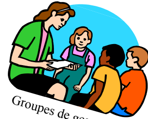
Groupes de ges-