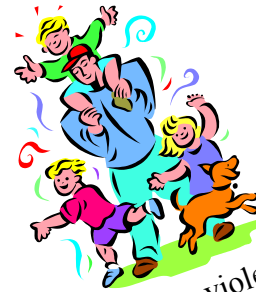
Vivre sans violence