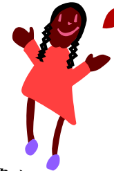
Initiation à la vie