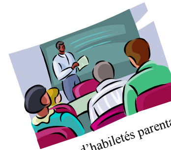
Groupes d'habiletés parentales