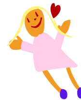
Partir d'un bon pas